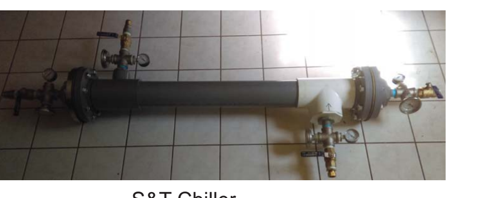
S&T Chiller Heat Transfer Area: 10.97 ft^2

Plate Heat Exchanger Heat Transfer Area: 5.17 ft^2