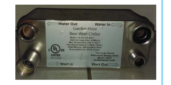
Plate Heat Exchanger Heat Transfer Area: 5.17 ft^2