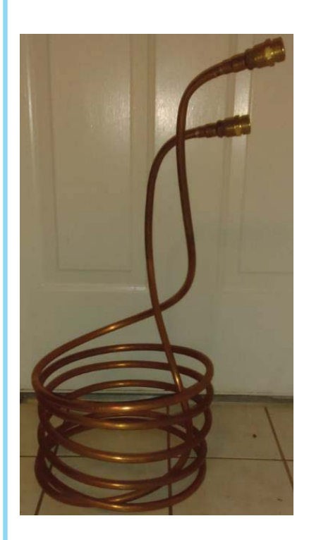
Copper Immersion Chiller Heat Transfer Area: 2.62 ft^2

The two types of heat exchangers used here to compare performance were chosen due to their cooling ability being predicted to be either better or worse than the S&T exchanger to be designed in this study. An immersion chiller and a plate chiller were chosen for comparison. The immersion chiller was constructed as well, but the plate chiller was purchased as the facilities for machining stainless steel were not available.